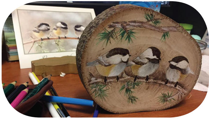
may not be photo of choice for class

As Part of the New Brunswick Carving Competition and Show Contact them for price and payment. Pre-Registration Required. Space is Limited.